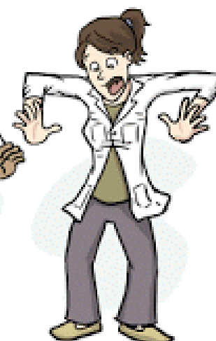
WRONG SIZE OR DID YOU GAIN WEIGHT?