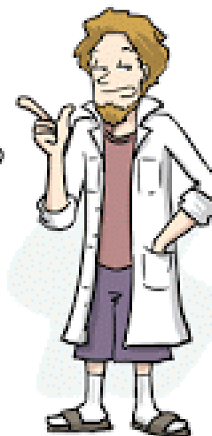
TOO COOL (TO USE THE BUTTONS)