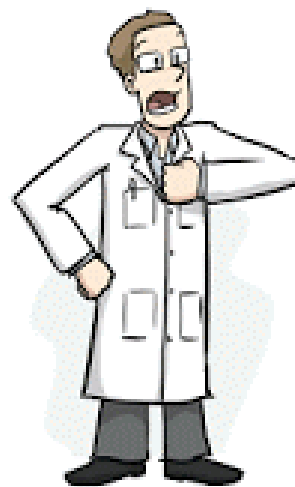
PRIM AND PROPER I AM... A SCIENTIST!