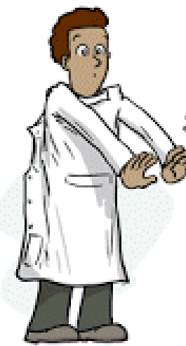
BACKWARDS ODD, BUT... KINDA MAKES SENSE?